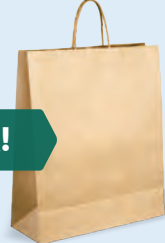
Recyclable Paper Bag for 10¢